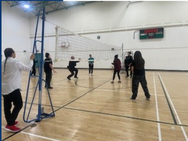
Mihtatakaw Sipi School Gym Day